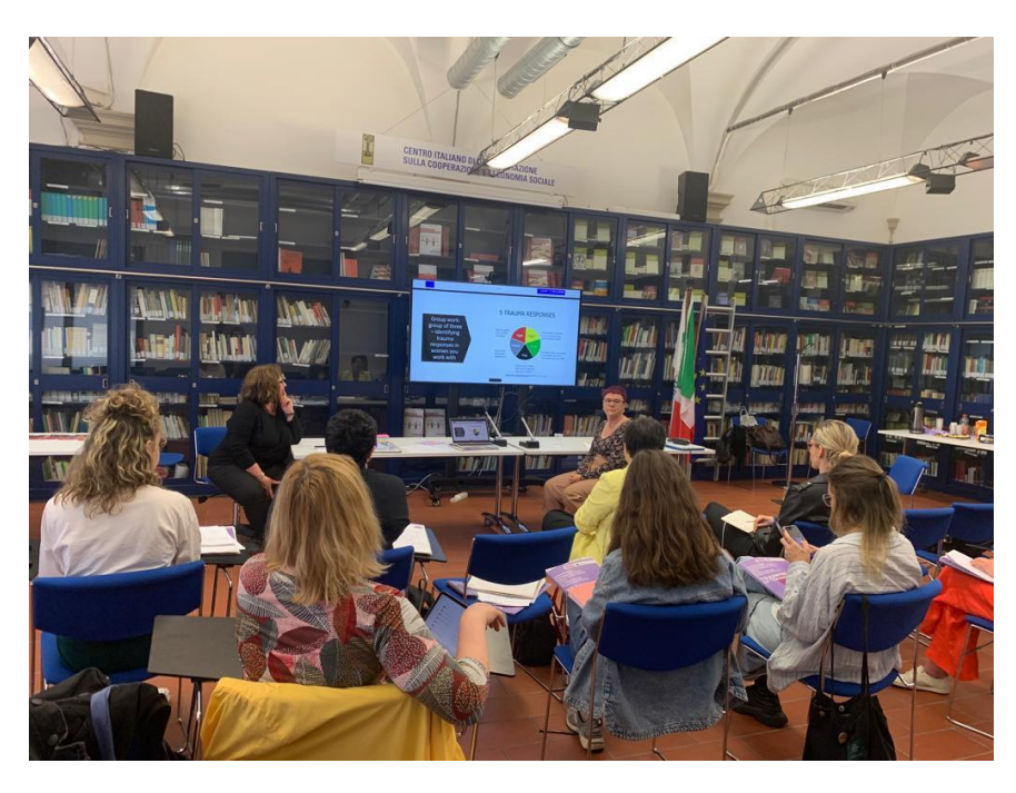
ToT for social workers, 5<sup>th</sup>-9<sup>th</sup> June, Bologna, Italy

The Training of Trainers (ToT) for social workers were held from the 5<sup>th</sup> to the 9<sup>th</sup> of June, while the ToT for psychologist were held from the 12<sup>th</sup> to the 16<sup>th</sup> of June, in Bologna. The trainings consisted of a 5-day interactive and immersive workshop program regarding essential concepts and practices of TIC implementation across different workplace settings.