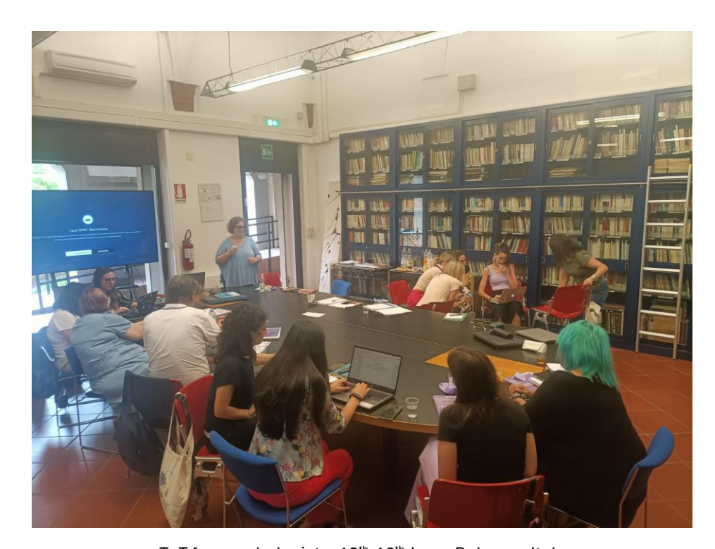
ToT for psychologists, 12<sup>th</sup>-16<sup>th</sup> June, Bologna, Italy

The main goal of the training was to encourage practitioners to be mindful and critical of their standard practices and of their knowledge transfer styles as trainers. The training was therefore intended to increase awareness among workers of the effects of trauma on women victims of violence and their children and to promote the dissemination of the approach in their workplaces. Furthermore, the course aimed to motivate trainers to find a means of embedding TIC effectively into their training initiatives with a special attention to the organizational cultures they belong to.